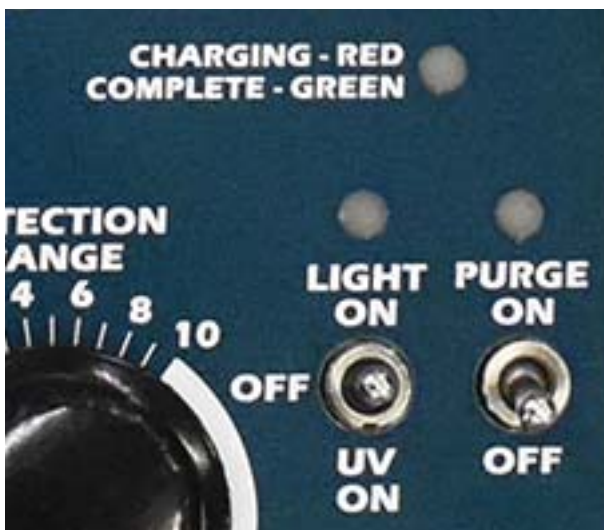
3-Position Switch for UV and White LED Light

The white LED array feature is desirable for use as a flashlight in dimly lit or low visibility environments. When using this feature, a backlight will illuminate the Analog Meter Display.