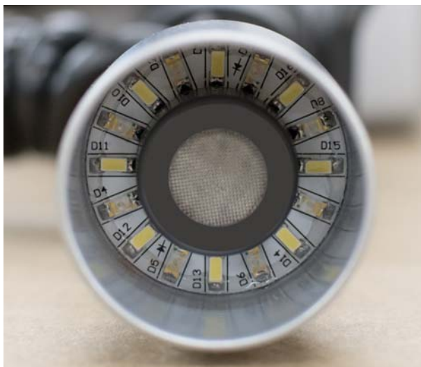
UV and White LEDs arrayed around the Sensor

The LED features of your Model 950-ASH consist of an array of eight long-wave ultraviolet (395 nm) LEDs and an array of eight white LEDs.