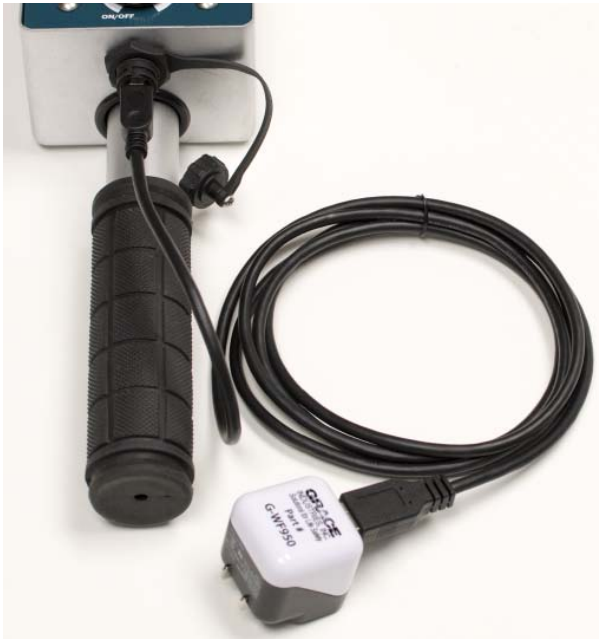
USB Charging Wall Plug Power Cube and Mini-USB Cord

950-ASH is powered by a rechargeable Lithium-ion battery with operating time of up to 7-8 hours of continuous use.