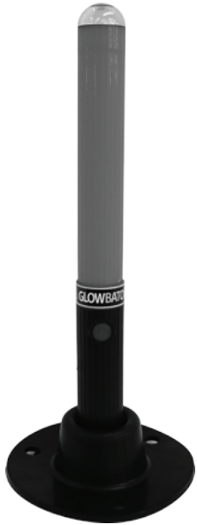
Glow Baton® in Rubber Base

Warranty claims process: 1) Obtain a Return Authorization Number from Grace Industries corporate headquarters by calling phone number 724-962-9231, or by email correspondence to sales@graceindustries.com. 2) The product name, serial number, date and proof of purchase must be provided and 3) Return products including Return Authorization Number, prepaid and accompanied by original proof of purchase that states the date and location of purchase to: Grace Industries, Inc., Service Department, 305 Bend Hill Road, Fredonia, PA 16124, USA. Customer is responsible for all shipping costs, return shipping costs, handling, or any other fees associated with a warranty claim.